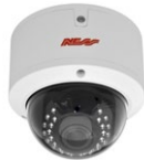
104-577 AHD 1.3mp IR Vandal Dome Camera (2.8~12mm Lens)

NVIEW AHD DVRs are also compatible with all standard analogue cameras