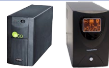
Protect your valuable devices with a 101-185 600VA UPS or 104-331 1600VA UPS

NVIEW AHD DVRs are also compatible with all standard analogue cameras