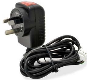
9V DC Plug Pack