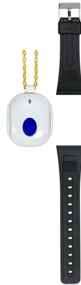
Pendant Transmitter including neckchain and wrist strap