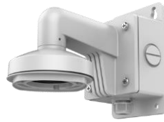
DS-1272ZJ-120B Wall Mount