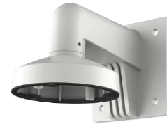
DS-1272ZJ-120-TR15 Wall Mount